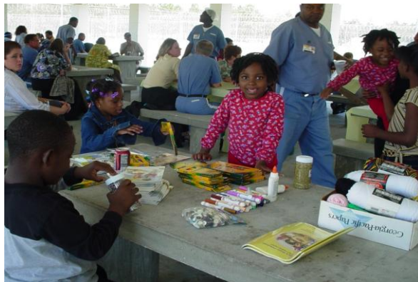
Family Day at one of our Faith and Character Based institutions

The Faith and Character Based (FCB) Programs seek to unite corrections and the faith community to effect an inner transformation of inmates. The purpose is to reduce disciplinary infractions in correctional institutions by offering programming that promotes prosocial behavior. The FCB Programs is one of the re-entry efforts centered on strategies which are proven effective and designed to reduce spending on corrections, increase public safety, and improve conditions in the neighborhoods to which most inmates and offenders return. The ultimate goal is that through this inner transformation there will be a reduction in recidivism and a smoother transition into society in order that ex-offenders can become productive citizens.